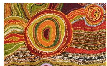
Wynne Prize 2016 Ken Family Collaborative's 'Seven Sisters'

Full list of Call for Entries, Grants & Awards can be found on our website. Click Here